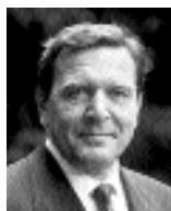
Dr. Gerhard Schröder Former Chancellor of the Federal Republic of Germany