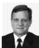
Hartmut Mehdorn Chairman of the Board Deutsche Bahn AG