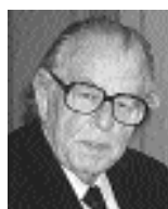
Hans-Jürgen Wischniewski + Federal Minister ret. / Minister of State ret.

for the tenth year in a row, as is reflected in the membership statistics. Once again, the Association recorded another net growth in its membership numbers, welcoming more than 150 new NUMOV members.